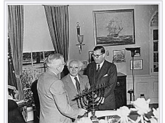
Truman in the Oval Office, receiving a Hanukkah Menorah from the prime minister of Israel, David Ben-Gurion (center). To the right is Abba Eban , ambassador of Israel to the United States

Truman decided to recognize Israel over the objections of Secretary of State George Marshall , who feared it would hurt relations with the populous Arab states. Marshall believed the paramount threat to the United States was the Soviet Union and feared Arab oil would be lost to the United States in the event of war; he warned Truman the United States was "playing with fire with nothing to put it out". [165] Truman recognized the State of Israel on May 14, 1948, eleven minutes after it declared itself a nation. [166][167] Of his decision to recognize the Israeli state, Truman wrote in his memoirs : "Hitler had been murdering Jews right and left. I saw it, and I dream about it even to this day. The Jews needed some place where they could go. It is my attitude that the American government couldn't stand idly by while the victims [of] Hitler's madness are not allowed to build new lives." [168]